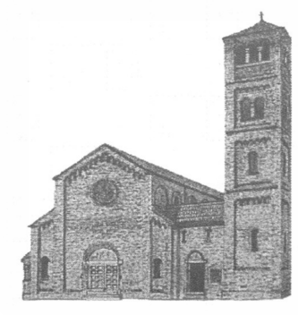
Today's Mass Readings Ezekiel 33:7-9; Psalm 94; Romans 13:8-10; Matthew 18:15-20

Talk to God before Mass Listen to God during Mass Talk to others after Mass