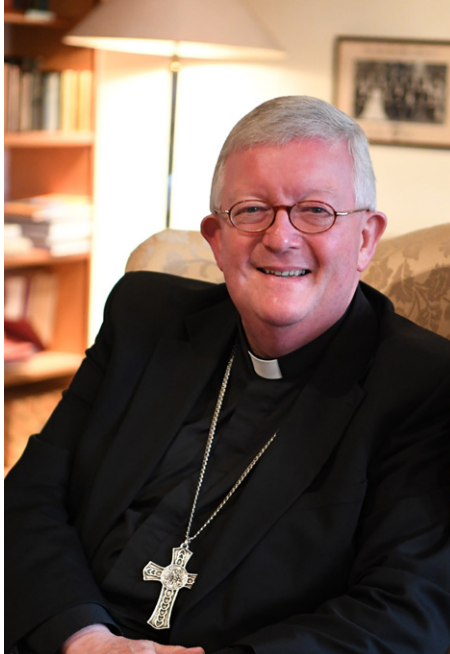
Bernard Longley, Archbishop of Birmingham