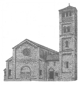
Today's Mass Readings Acts 10: 34, 37-43; Psalm 117; 1 Corinthians 5: 6-8;

Talk to God before Mass Listen to God during Mass Talk to others after Mass